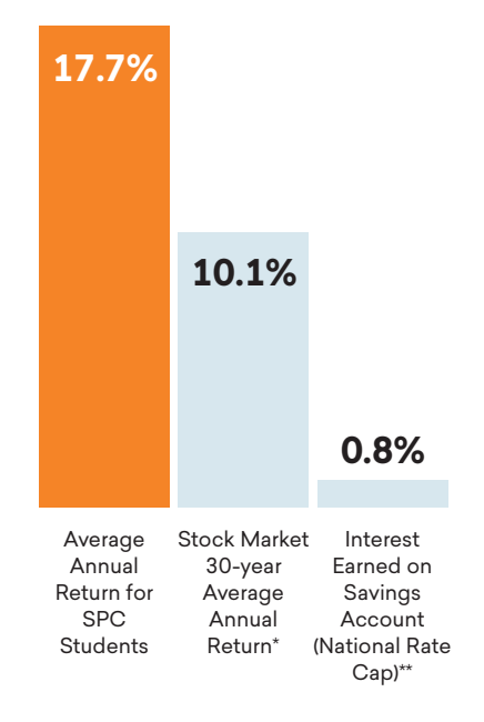
FIGURE 2: Student rate of return

Benefits to society also consist of the savings generated by the improved lifestyles of students. Similar to the taxpayer section above, education is statistically correlated with a variety of lifestyle changes that generate social savings. Note that these costs are avoided by the consumers, and are distinct from the costs avoided by taxpayers outlined above. Health savings include avoided medical costs associated with smoking, alcoholism, obesity, drug abuse, and mental disorders. Crime savings include reduced security expenditures and insurance administration, lower victim